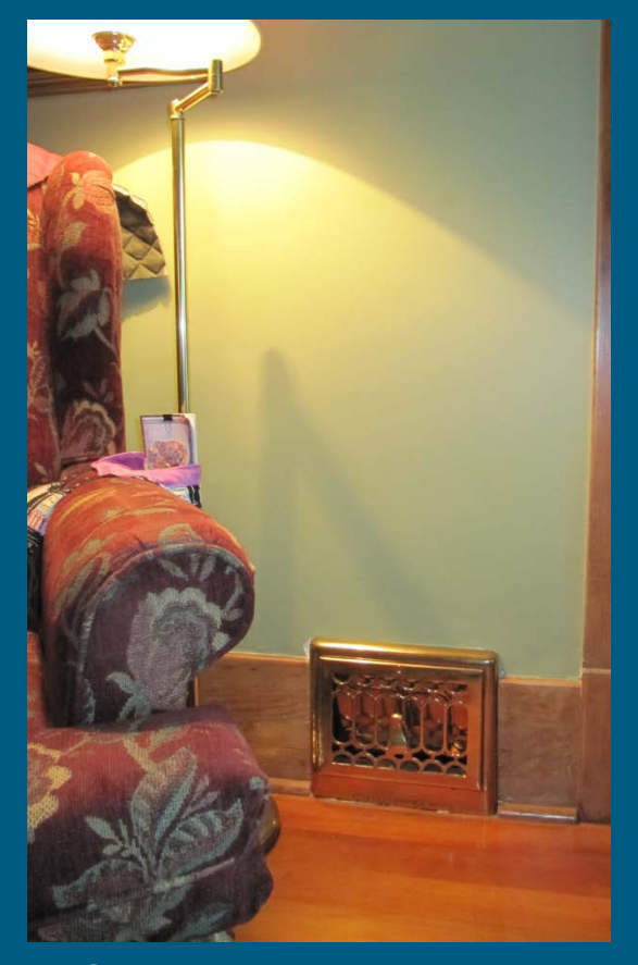
Original Brass Vent