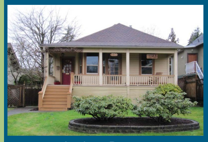
Audrey Brown 336 East 9<sup>th</sup> Street Small Scale Heritage Improvement Award