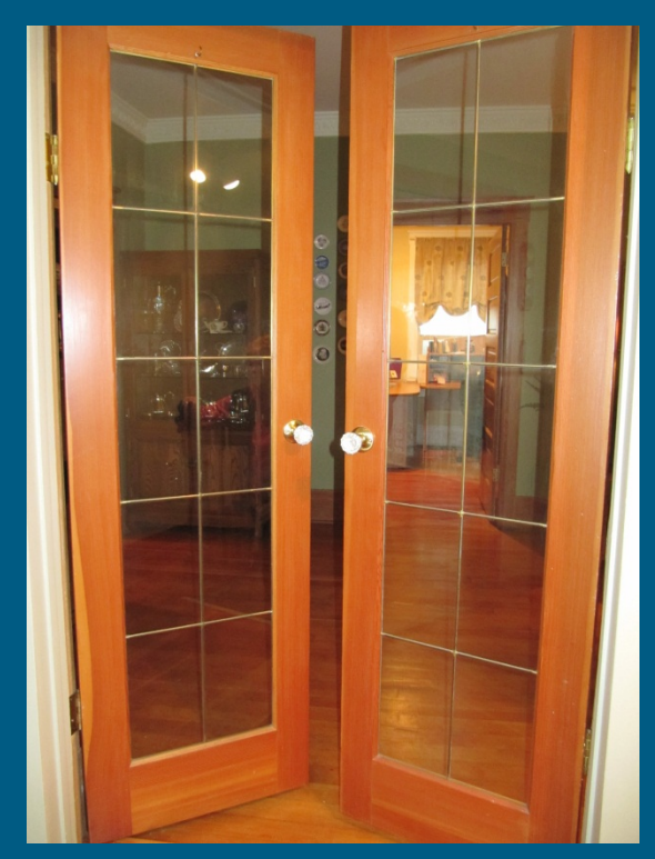
Original French doors