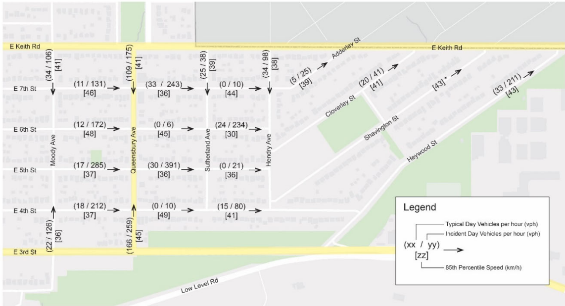
2018 Traffic Data Summary (After Plan Implementation)