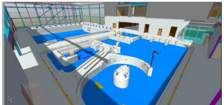
3D Model (BIM) of Aquatics area