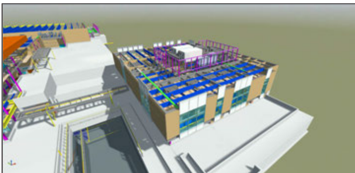
3D Model (BIM) of Silver Harbour