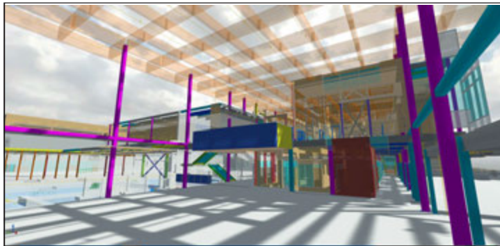
3D Model (BIM) of the Community Atrium