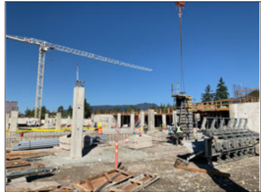
Concrete vertical works taking shape