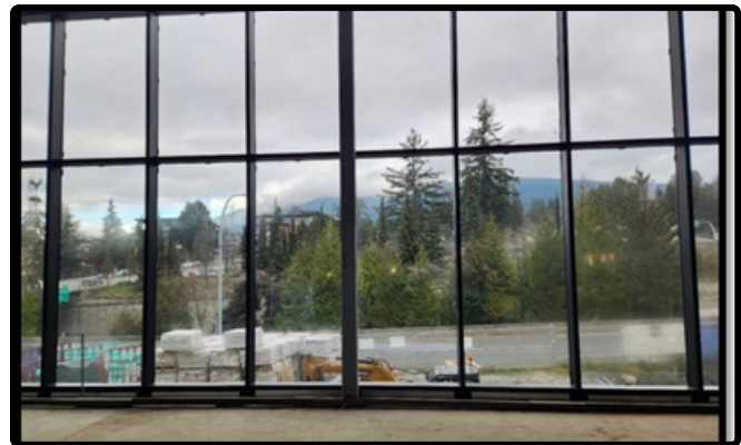
Fitness Centre under construction