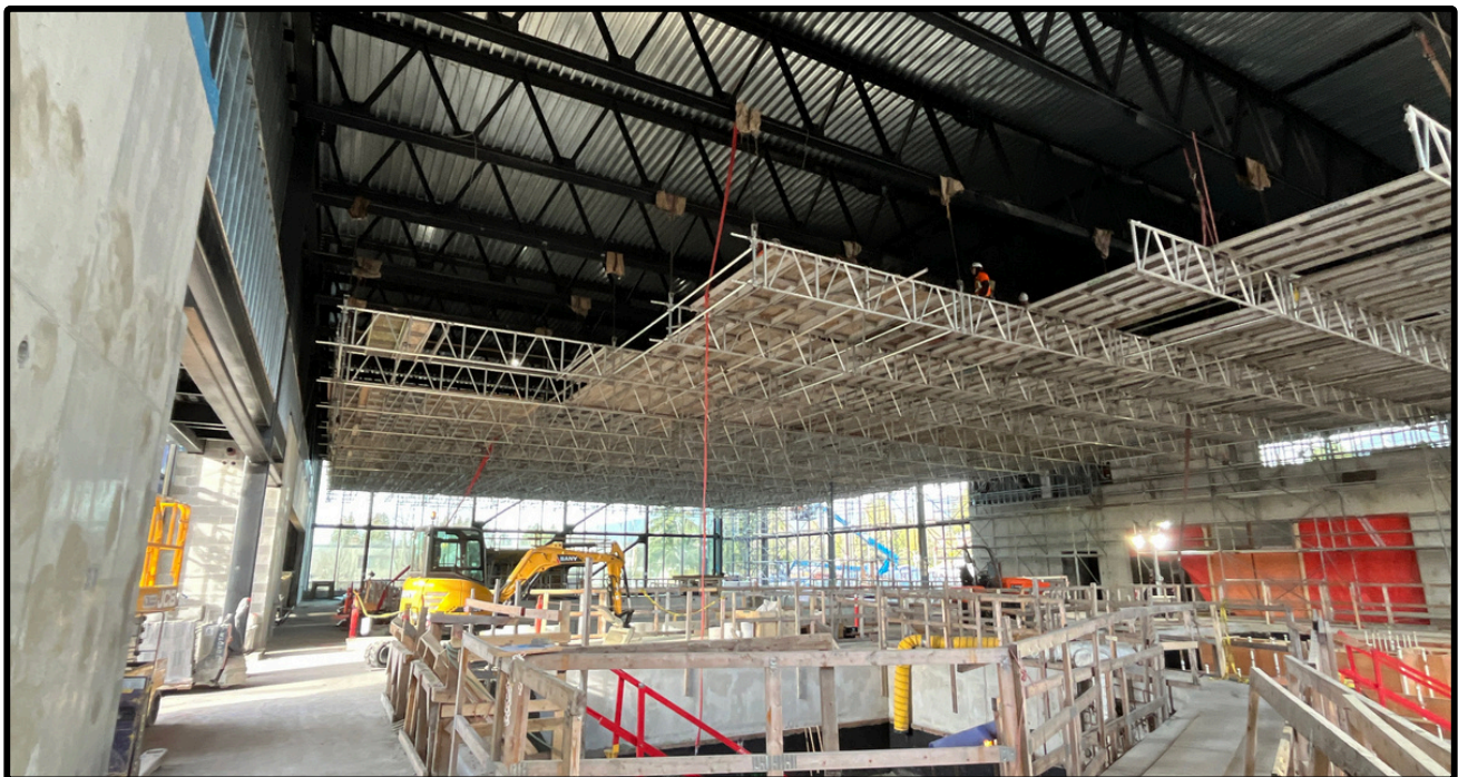
Aquatics Centre temporary work platform