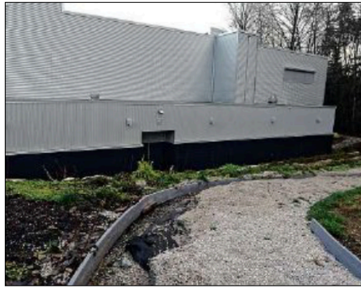
A combination of rapid snowmelt and plugged drains resulted in water damage over the Christmas break to the floors of the gymnasiums at the new Ecole Argyle Secondary in Lynn Valley. The main gym is pictured to the east of the unfinished school sports field, on Jan. 2.

into two or three separate spaces, or opened up completely to accommodate larger events and competitions.